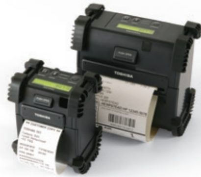
DESIGNHUT.CO.UK - JN714