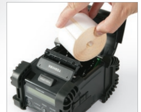
Market-leading media capacity for fewer roll changes