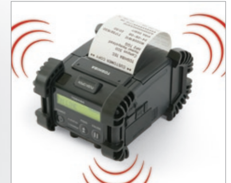
Wi-Fi certified (GH40 model)