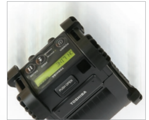
Robust and rugged, withstands a 1.8m drop on to concrete (1.5m for B-EP4)