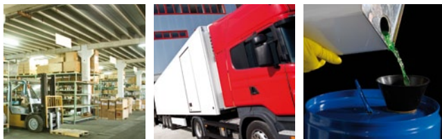
* The B-EX4T2 was benchmarked against competitor products in stand-by mode.